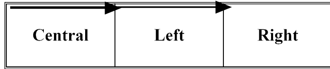
Figure 2: Intra Block Copy: Merging 3 frames into one compound frame with 3 tiles. The arrows denote the inter-tile prediction and the respective translation vectors.

The respective translation vector search starts always with the translation vector corresponding to the inter-view disparity vector for co-located blocks in the neighboring view. The translation vector estimation may be implemented in a way similar to motion vector search, or to disparity vector search. Also, we assume that the translation vectors may exhibit values being multiples of \frac{1}{4} , i.e. they exhibit the quarter-pel accuracy. We change the single-layer bitstream syntax accordingly. This change is not critical as the proposed translation vector format is the same as that for motion vectors used in the temporal interframe prediction.