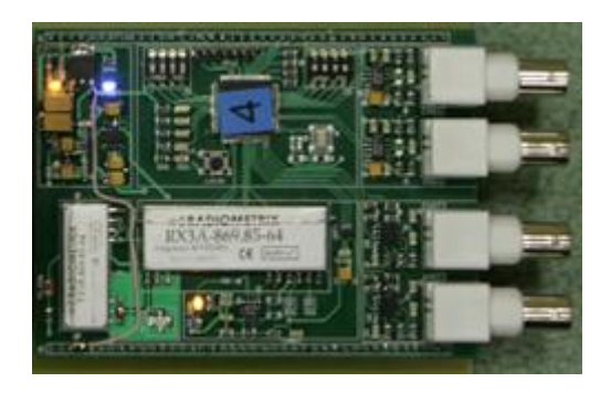
Figure 2. Wireless synchronization module.

The test video sequences have been recorded using the camera arrangement depicted in Fig. 3. The system may be easily used both outdoor (Fig. 4) and indoor (Fig. 5).