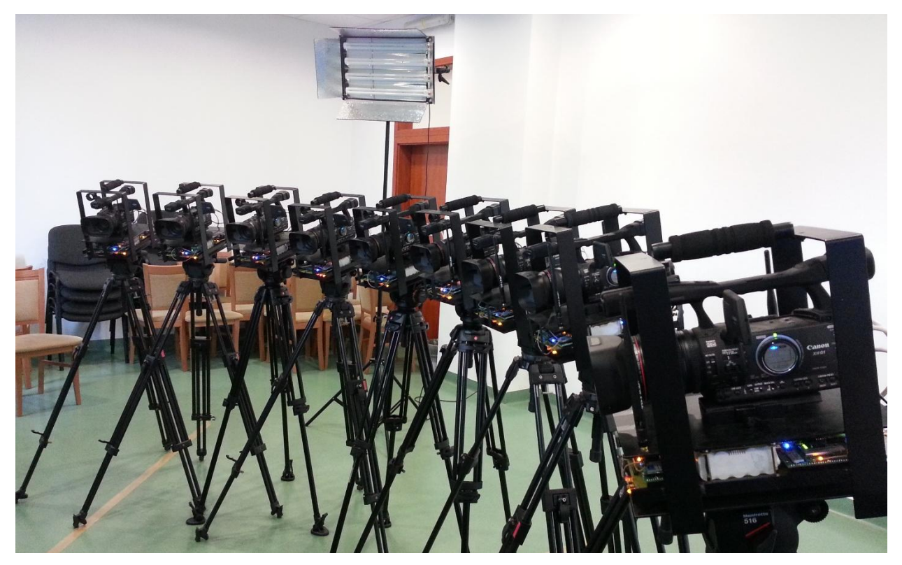
Figure 5. Multi-camera setup used in production of "Poznan Blocks" test sequence.