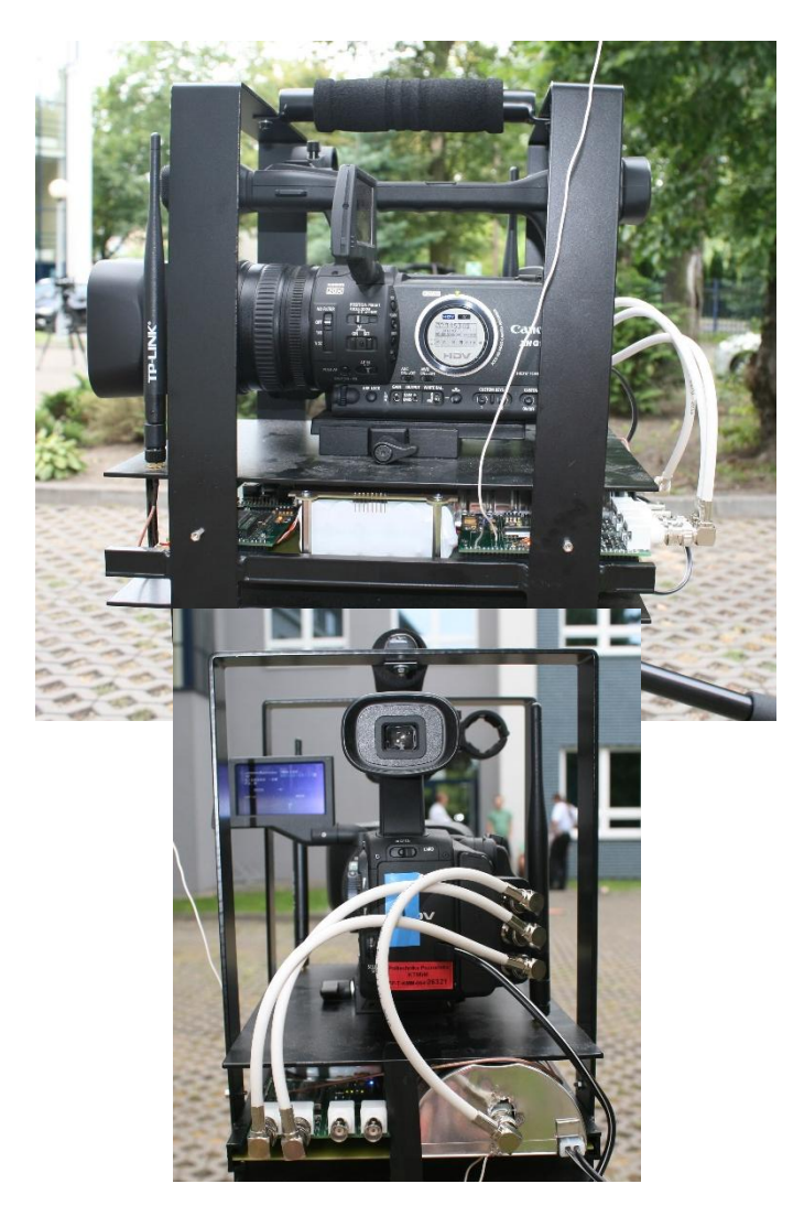
Figure 1. Wireless mobile camera module (side and rear views).