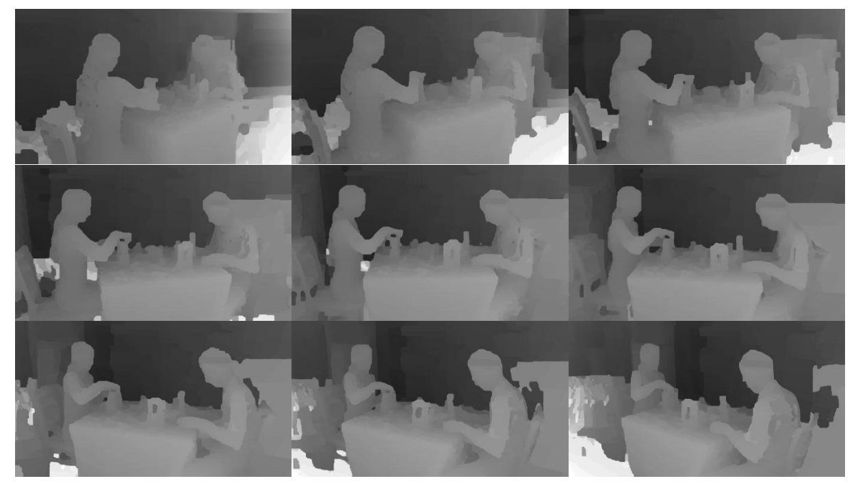
Figure 8. Exemplary depth frames from "Poznan Blocks" sequence.

The depth data is provided along with the videos. The depth maps (Figs. 8 and 9) were algorithmically estimated from the videos. The estimation has been done fully-automatically with the use of in-house propriety depth estimation algorithm. In contrast to Depth Estimation Reference Software [3], where depth for only a single view is estimated at once, our estimation technique can estimate depth maps for all of the views. For that, all of the input views are used at once. This allows higher depth quality and reduces estimation time. Also, higher degree of interview depth consistency is attained.