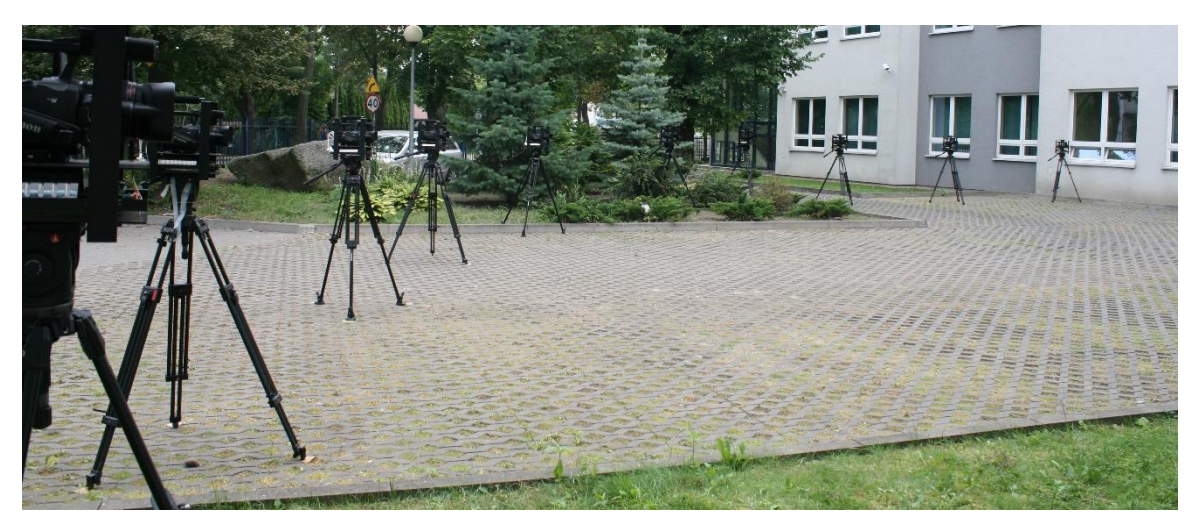
Figure 4. Multi-camera setup used in production of "Poznan Team" test sequence.