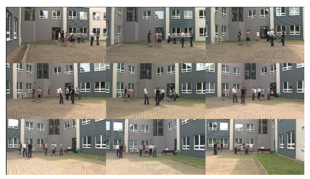
Figure 7. Exemplary frames from "Poznan Team" sequence.