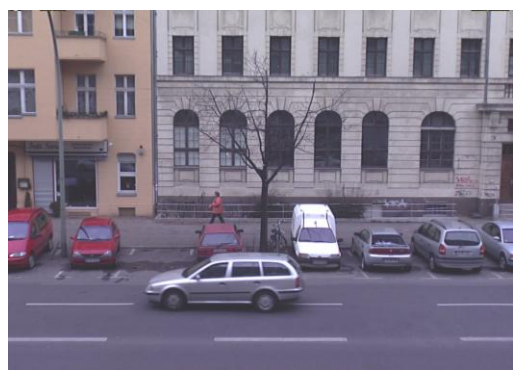
a) original sequence